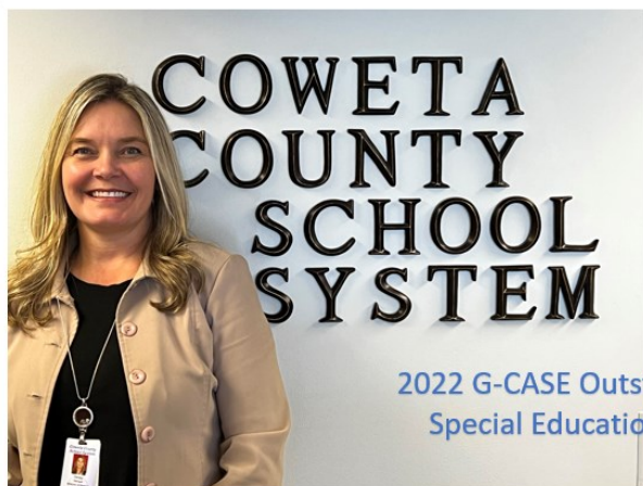
2022 G-CASE Outstanding New Special Education Director

Nominations will be accepted until February 5, 2023 . Please visit this link for more information and application: 2023 Outstanding New Special Education Director Application