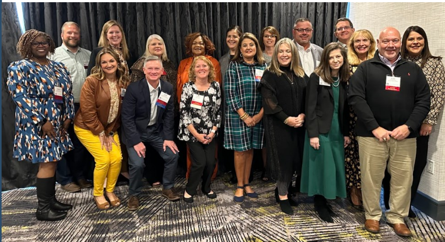
2022-2023 G-CASE Executive Board

March, with the chair of each committee bringing back recommendations to the Executive Board at their meeting on March 6, 2023. Whether you are already passionate about the committee subject, want to learn more about it, or just want to be a part of something wonderful, taking part on a G-CASE committee is a fun and informative way to get involved in something BIG with a group of people who will become your best professional friends!